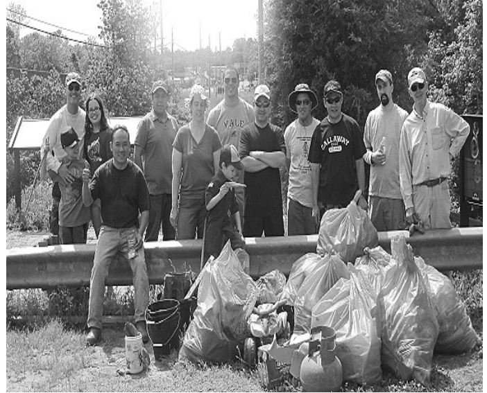
Volunteers - Bull Run Adopt A Stream May 7th

For the most part we had excellent weather on these occasions but they were not as well attended by the general public as they had been in 2010. Fortunately there were many Chapter Members, who did contribute a great deal of their time to these efforts.